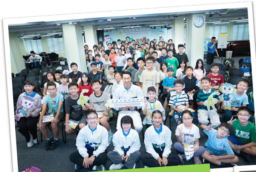
Programme Experience Day 2025