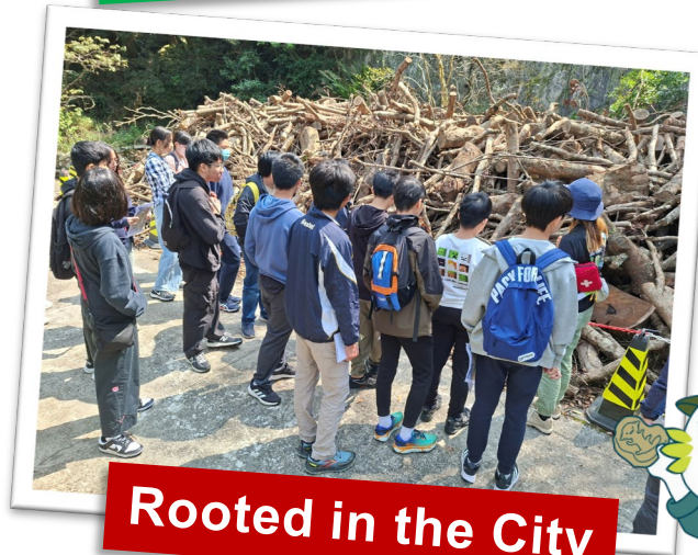
Rooted in the City