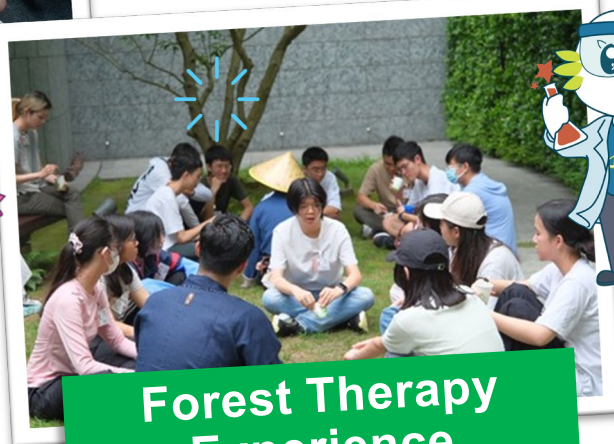
Forest Therapy Experience