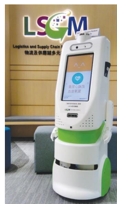
Smart Service Robot