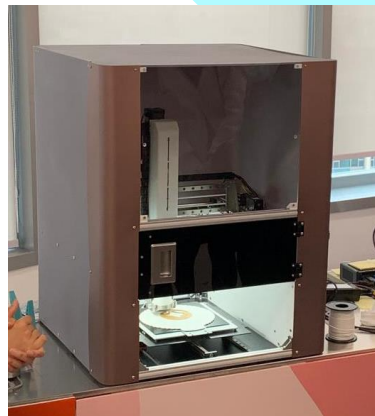
Robotic Kitchen for Elderly