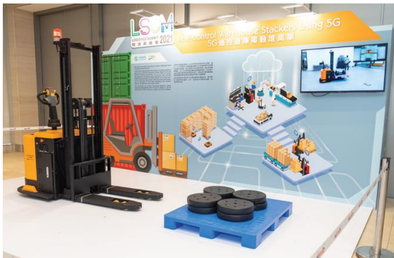
Tele-Control Warehouse Stackers Using 5G