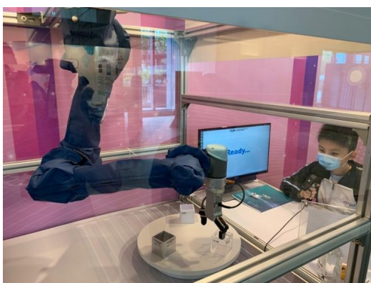
Voice Control Robotic Arm