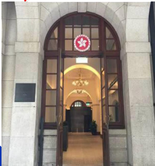
公眾入口 Public Entrance (朝向皇后像廣場 Facing Statue Square)